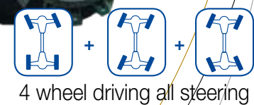
4 wheel driving all steering