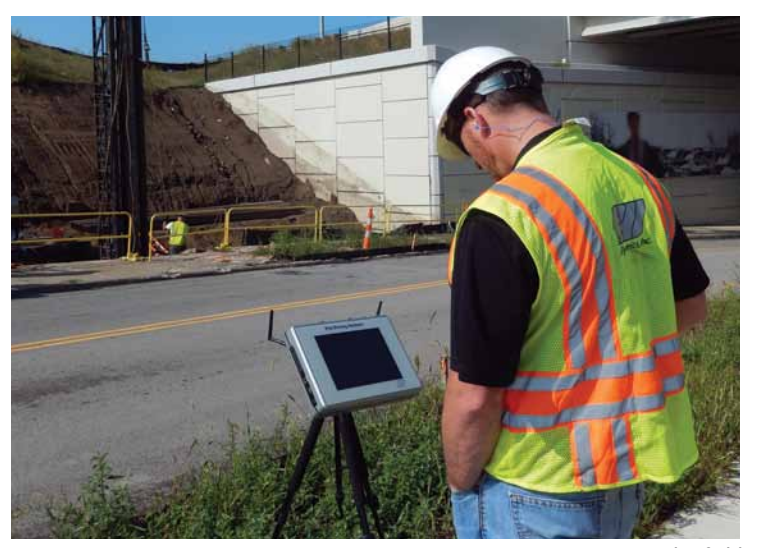
PDA-8G in the field

conducting the test with four or more wireless strain transducers.