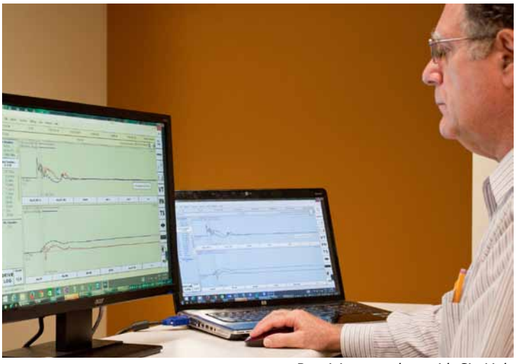
Receiving test data with SiteLink.